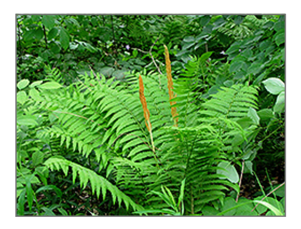
Cinnamon Fern in bloom