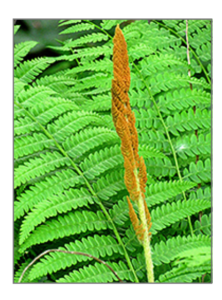
Cinnamon Fern flowers