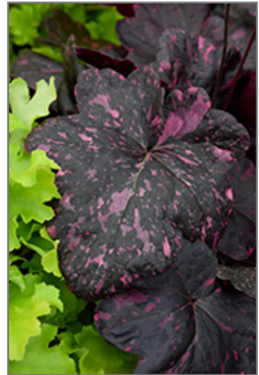
Midnight Rose Coral Bells foliage

Midnight Rose Coral Bells is recommended for the following landscape applications;