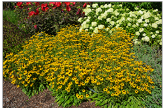
American Gold Rush Coneflower in bloom