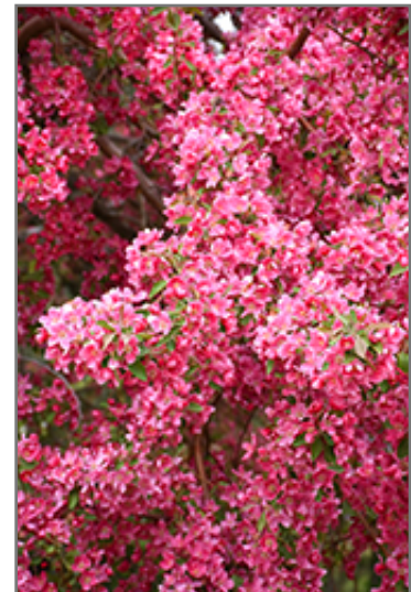
Prairifire Flowering Crab flowers