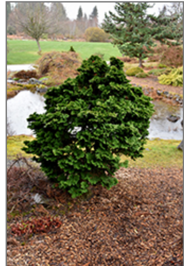
Dwarf Hinoki Falsecypress