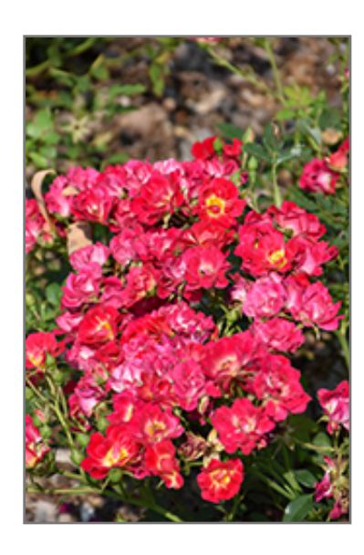
Pink Drift Rose flowers

This shrub will require occasional maintenance and upkeep, and is best pruned in late winter once the threat of extreme cold has passed. Gardeners should be aware of the following characteristic(s) that may warrant special consideration;