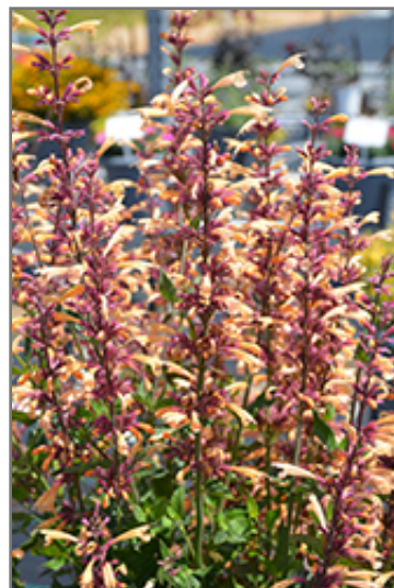
Meant To Bee Queen Nectarine Anise Hyssop flowers

This is a relatively low maintenance plant, and is best cleaned up in early spring before it resumes active growth for the season. It is a good choice for attracting bees, butterflies and hummingbirds to your yard, but is not particularly attractive to deer who tend to leave it alone in favor of tastier treats. It has no significant negative characteristics.