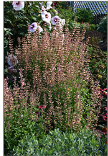
Meant To Bee Queen Nectarine Anise Hyssop in bloom

Meant To Bee Queen Nectarine Anise Hyssop is a fine choice for the garden, but it is also a good selection for planting in outdoor pots and containers. With its upright habit of growth, it is best suited for use as a 'thriller' in the 'spiller-thriller-filler' container combination; plant it near the center of the pot, surrounded by smaller plants and those that spill over the edges. It is even sizeable enough that it can be grown alone in a suitable container. Note that when growing plants in outdoor containers and baskets, they may require more frequent waterings than they would in the yard or garden.