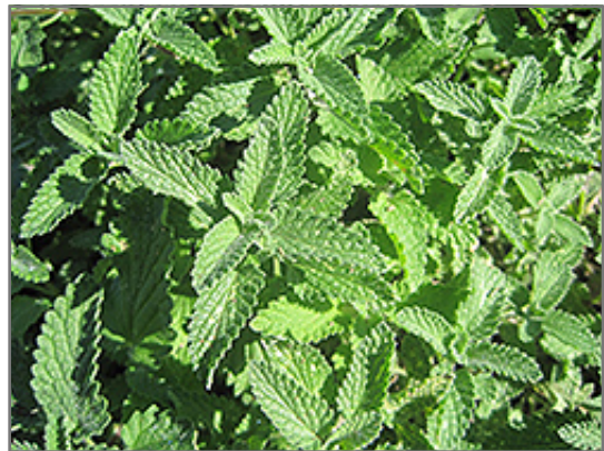
Walker's Low Catmint foliage

Walker's Low Catmint will grow to be about 12 inches tall at maturity extending to 16 inches tall with the flowers, with a spread of 12 inches. Its foliage tends to remain dense right to the ground, not requiring facer plants in front. It grows at a fast rate, and under ideal conditions can be expected to live for approximately 10 years. As an herbaceous perennial, this plant will usually die back to the crown each winter, and will regrow from the base each spring. Be careful not to disturb the crown in late winter when it may not be readily seen!