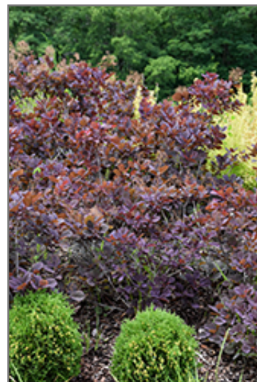
Velveteeny Purple Smokebush