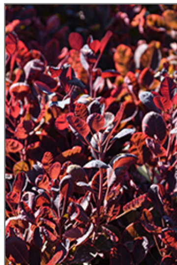
Velveteeny Purple Smokebush foliage

Velveteeny Purple Smokebush makes a fine choice for the outdoor landscape, but it is also well-suited for use in outdoor pots and containers. With its upright habit of growth, it is best suited for use as a 'thriller' in the 'spiller-thriller-filler' container combination; plant it near the center of the pot, surrounded by smaller plants and those that spill over the edges. It is even sizeable enough that it can be grown alone in a suitable container. Note that when grown in a container, it may not perform exactly as indicated on the tag - this is to be expected. Also note that when growing plants in outdoor containers and baskets, they may require more frequent waterings than they would in the yard or garden.