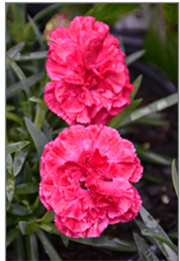
Fruit Punch Raspberry Ruffles Pinks flowers