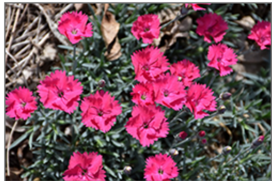
Paint The Town Magenta Pinks flowers