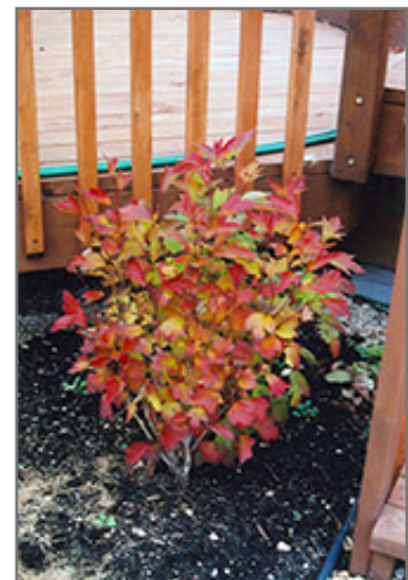
Compact Highbush Cranberry in fall