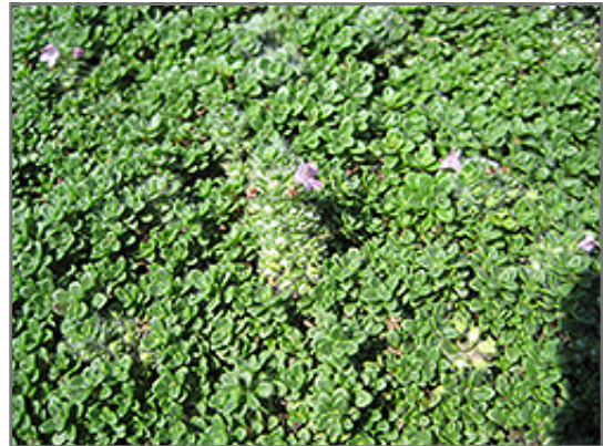
Elfin Creeping Thyme in bloom

Elfin Creeping Thyme is a dense herbaceous evergreen perennial with a ground-hugging habit of growth. It brings an extremely fine and delicate texture to the garden composition and should be used to full effect.