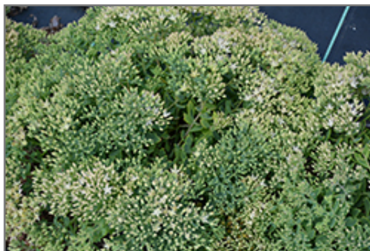
Thundercloud Stonecrop flower buds