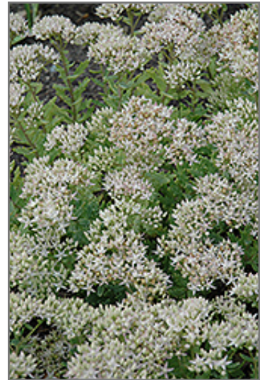
Thundercloud Stonecrop flowers

Thundercloud Stonecrop is a dense herbaceous perennial with a mounded form. Its relatively fine texture sets it apart from other garden plants with less refined foliage.