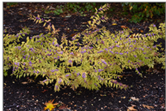
Early Amethyst Beautyberry fruit