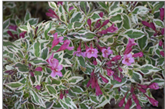
My Monet Weigela flowers

My Monet Weigela is recommended for the following landscape applications;