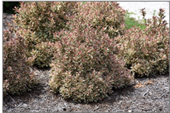
My Monet Weigela

My Monet Weigela makes a fine choice for the outdoor landscape, but it is also well-suited for use in outdoor pots and containers. It is often used as a 'filler' in the 'spiller-thriller-filler' container combination, providing a mass of flowers and foliage against which the thriller plants stand out. Note that when grown in a container, it may not perform exactly as indicated on the tag - this is to be expected. Also note that when growing plants in outdoor containers and baskets, they may require more frequent waterings than they would in the yard or garden.