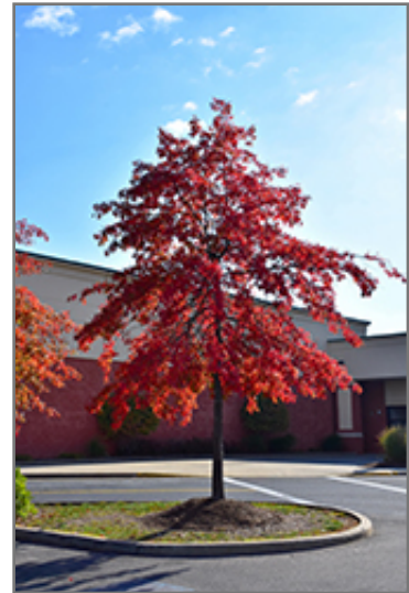
Pin Oak in fall