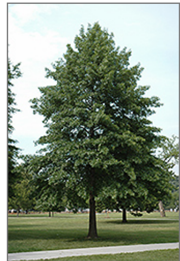
Pin Oak