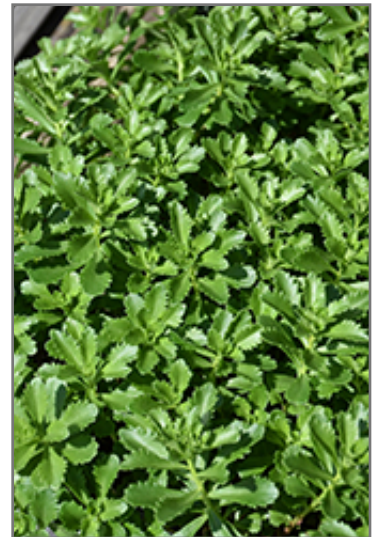
Japanese Stonecrop