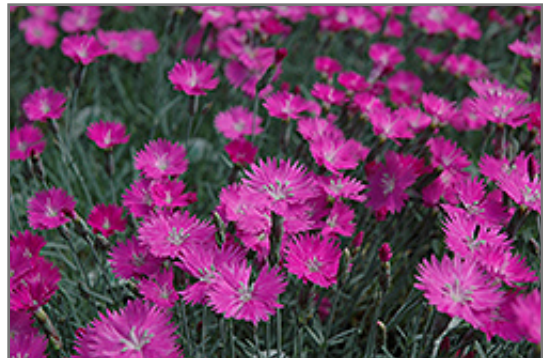
Firewitch Pinks flowers