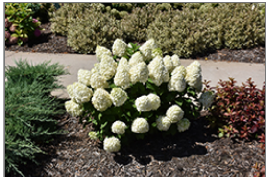
Little Lime Punch Hydrangea in bloom

Little Lime Punch Hydrangea makes a fine choice for the outdoor landscape, but it is also well-suited for use in outdoor pots and containers. With its upright habit of growth, it is best suited for use as a 'thriller' in the 'spiller-thriller-filler' container combination; plant it near the center of the pot, surrounded by smaller plants and those that spill over the edges. It is even sizeable enough that it can be grown alone in a suitable container. Note that when grown in a container, it may not perform exactly as indicated on the tag - this is to be expected. Also note that when growing plants in outdoor containers and baskets, they may require more frequent waterings than they would in the yard or garden.