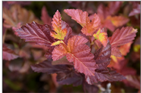
Center Glow Ninebark foliage

This shrub will require occasional maintenance and upkeep, and can be pruned at anytime. It has no significant negative characteristics.