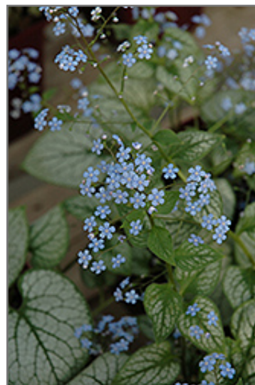
Jack Frost Bugloss flowers