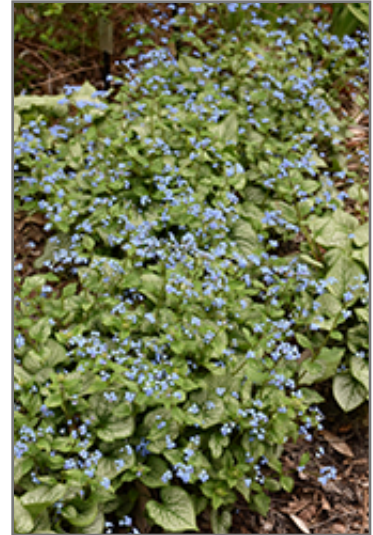
Jack Frost Bugloss in bloom

Jack Frost Bugloss will grow to be about 12 inches tall at maturity extending to 16 inches tall with the flowers, with a spread of 18 inches. When grown in masses or used as a bedding plant, individual plants should be spaced approximately 14 inches apart. It grows at a medium rate, and under ideal conditions can be expected to live for approximately 10 years. As an herbaceous perennial, this plant will usually die back to the crown each winter, and will regrow from the base each spring. Be careful not to disturb the crown in late winter when it may not be readily seen!