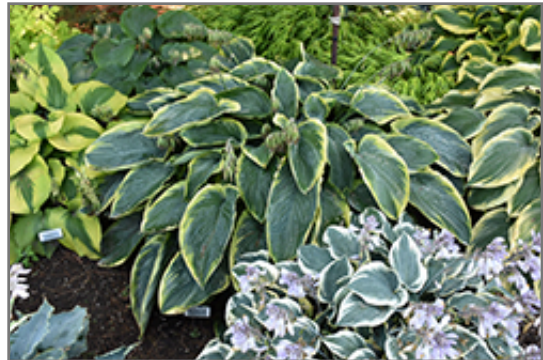
Shadowland Wu-La-La Hosta

Shadowland Wu-La-La Hosta is a dense herbaceous perennial with a mounded form. Its medium texture blends into the garden, but can always be balanced by a couple of finer or coarser plants for an effective composition.