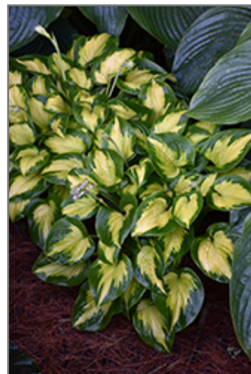
Shadowland Etched Glass Hosta

This is a relatively low maintenance plant, and is best cleaned up in early spring before it resumes active growth for the season. Gardeners should be aware of the following characteristic(s) that may warrant special consideration;