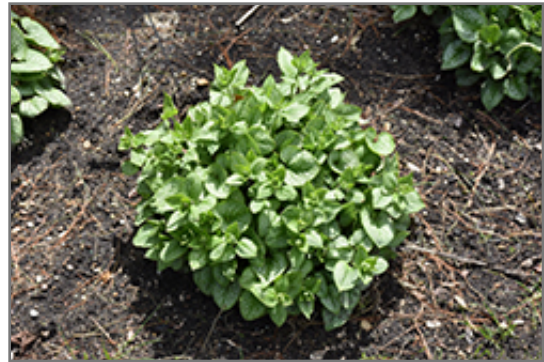
Jack of Diamonds Bugloss

Jack of Diamonds Bugloss will grow to be about 14 inches tall at maturity, with a spread of 30 inches. When grown in masses or used as a bedding plant, individual plants should be spaced approximately 28 inches apart. It grows at a medium rate, and under ideal conditions can be expected to live for approximately 10 years. As an herbaceous perennial, this plant will usually die back to the crown each winter, and will regrow from the base each spring. Be careful not to disturb the crown in late winter when it may not be readily seen!