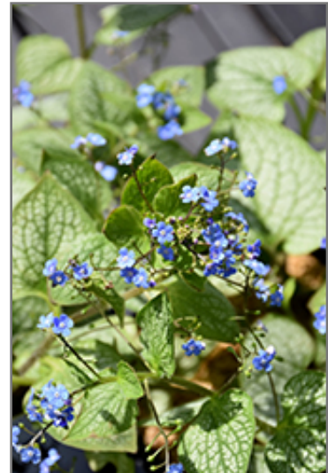
Jack of Diamonds Bugloss flowers

This is a relatively low maintenance plant, and should be cut back in late fall in preparation for winter. It has no significant negative characteristics.