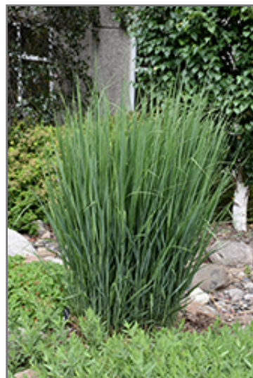
Northwind Switch Grass