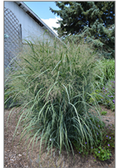
Northwind Switch Grass in bloom

This plant does best in full sun to partial shade. It is very adaptable to both dry and moist locations, and should do just fine under typical garden conditions. It is considered to be drought-tolerant, and thus makes an ideal choice for a low-water garden or xeriscape application. It is not particular as to soil type, but has a definite preference for alkaline soils, and is able to handle environmental salt. It is somewhat tolerant of urban pollution. This is a selection of a native North American species. It can be propagated by division; however, as a cultivated variety, be aware that it may be subject to certain restrictions or prohibitions on propagation.