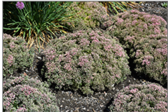
Rock 'N Round Pride and Joy Stonecrop in bloom