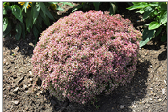
Rock 'N Round Pride and Joy Stonecrop in bloom