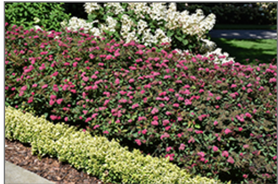
Double Play Doozie Spirea in bloom

Double Play Doozie Spirea is a multi-stemmed deciduous shrub with a more or less rounded form. Its relatively fine texture sets it apart from other landscape plants with less refined foliage.