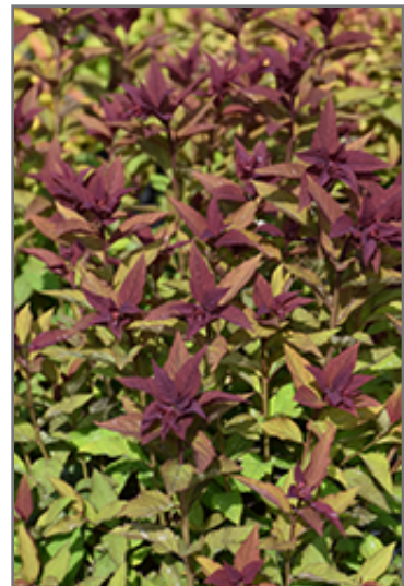
Double Play Doozie Spirea foliage

This shrub should only be grown in full sunlight. It prefers to grow in average to moist conditions, and shouldn't be allowed to dry out. It is not particular as to soil type or pH. It is highly tolerant of urban pollution and will even thrive in inner city environments. This particular variety is an interspecific hybrid.