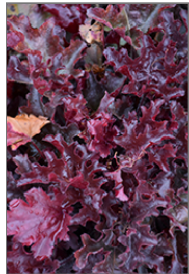
Dolce Cherry Truffles Coral Bells foliage