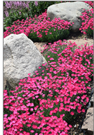
Paint The Town Magenta Pinks in bloom

Paint The Town Magenta Pinks is an herbaceous evergreen perennial with a mounded form. It brings an extremely fine and delicate texture to the garden composition and should be used to full effect.