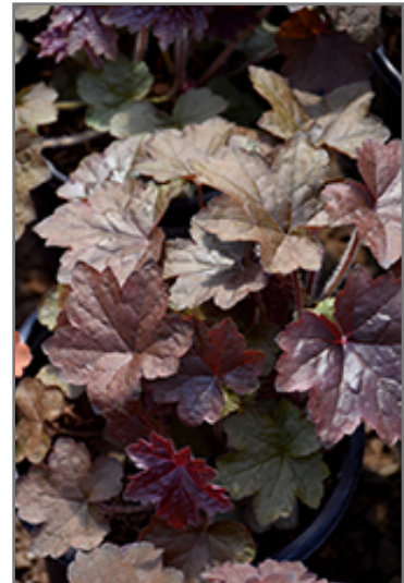
Palace Purple Coral Bells foliage

Palace Purple Coral Bells is recommended for the following landscape applications;