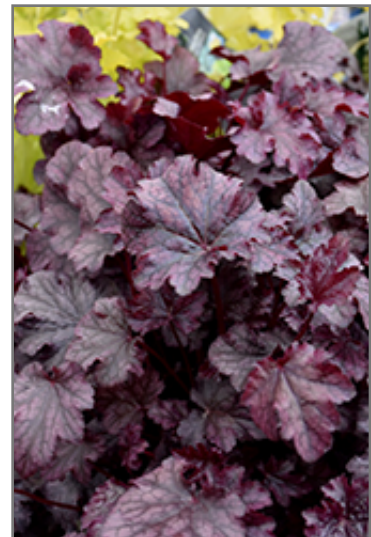
Plum Pudding Coral Bells foliage

This is a relatively low maintenance plant, and should be cut back in late fall in preparation for winter. It is a good choice for attracting hummingbirds to your yard. It has no significant negative characteristics.