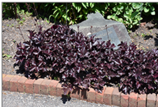
Obsidian Coral Bells