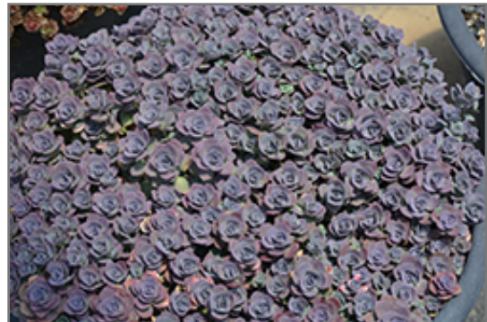
SunSparkler Blue Elf Sedoro