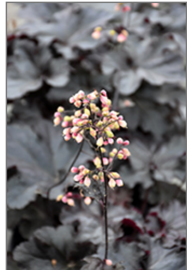
Black Pearl Coral Bells flowers