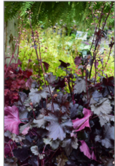
Black Pearl Coral Bells in bloom

This is a relatively low maintenance plant, and should be cut back in late fall in preparation for winter. It is a good choice for attracting hummingbirds to your yard. It has no significant negative characteristics.