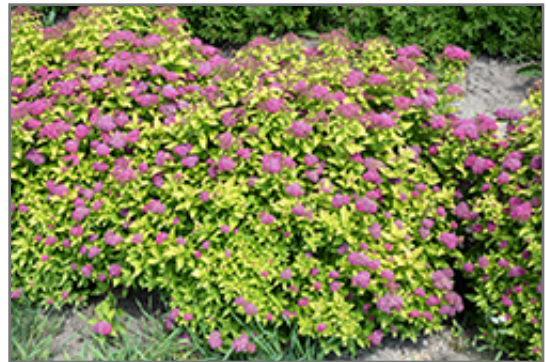
Double Play Gold Spirea in bloom