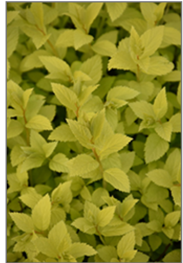
Double Play Gold Spirea foliage

This shrub should only be grown in full sunlight. It prefers to grow in average to moist conditions, and shouldn't be allowed to dry out. It is not particular as to soil type or pH. It is highly tolerant of urban pollution and will even thrive in inner city environments. This is a selected variety of a species not originally from North America.