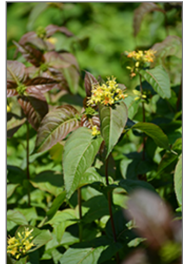
Kodiak Black Diervilla flowers