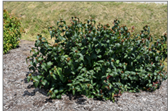
Kodiak Black Diervilla

This shrub will require occasional maintenance and upkeep, and is best pruned in late winter once the threat of extreme cold has passed. It is a good choice for attracting butterflies and hummingbirds to your yard. Gardeners should be aware of the following characteristic(s) that may warrant special consideration;