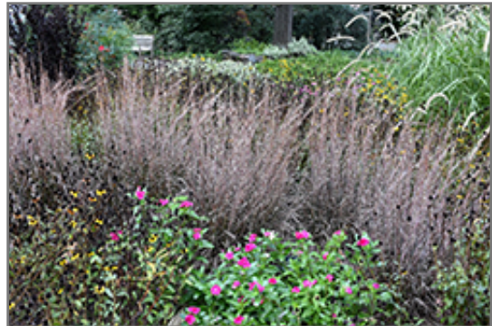
Standing Ovation Bluestem in fall

Standing Ovation Bluestem is recommended for the following landscape applications;