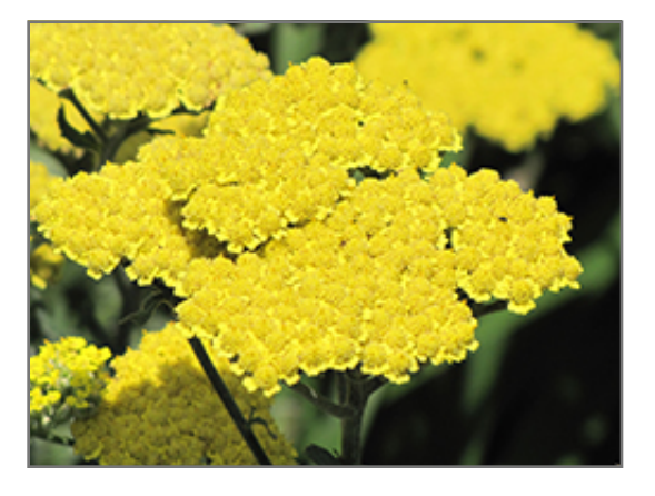
Moonshine Yarrow flowers

Moonshine Yarrow is smothered in stunning yellow flat-top flowers at the ends of the stems from late spring to late summer. The flowers are excellent for cutting. Its attractive tomentose ferny leaves remain grayish green in color throughout the season.