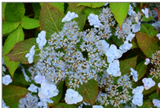
Tiny Tuff Stuff Hydrangea flowers