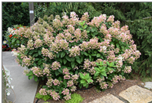
Little Quick Fire Hydrangea in bloom