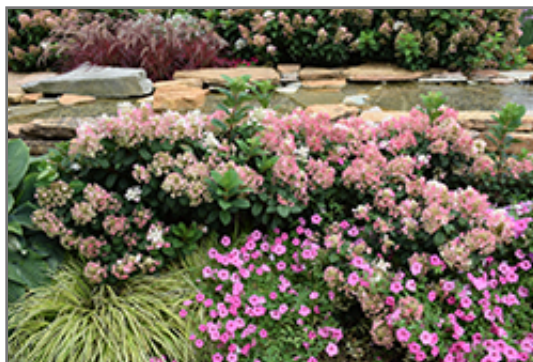
Little Quick Fire Hydrangea in bloom

Little Quick Fire Hydrangea makes a fine choice for the outdoor landscape, but it is also well-suited for use in outdoor pots and containers. With its upright habit of growth, it is best suited for use as a 'thriller' in the 'spiller-thriller-filler' container combination; plant it near the center of the pot, surrounded by smaller plants and those that spill over the edges. It is even sizeable enough that it can be grown alone in a suitable container. Note that when grown in a container, it may not perform exactly as indicated on the tag - this is to be expected. Also note that when growing plants in outdoor containers and baskets, they may require more frequent waterings than they would in the yard or garden.