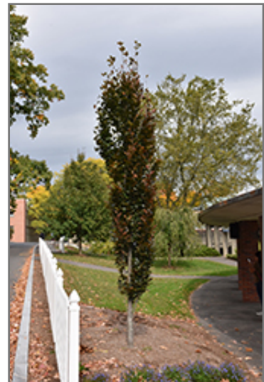
Dawyck Purple Beech

Dawyck Purple Beech is recommended for the following landscape applications;