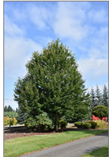
Redpointe Red Maple

Redpointe Red Maple is recommended for the following landscape applications;