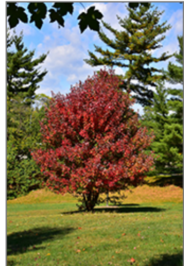
Redpointe Red Maple in fall

This tree should only be grown in full sunlight. It is quite adaptable, preferring to grow in average to wet conditions, and will even tolerate some standing water. It is not particular as to soil type, but has a definite preference for acidic soils, and is subject to chlorosis (yellowing) of the foliage in alkaline soils. It is somewhat tolerant of urban pollution. This is a selection of a native North American species.