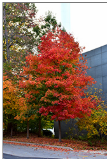
Fall Fiesta Sugar Maple in fall

Fall Fiesta Sugar Maple is recommended for the following landscape applications;