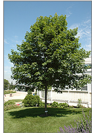
Fall Fiesta Sugar Maple

This tree should only be grown in full sunlight. It prefers to grow in average to moist conditions, and shouldn't be allowed to dry out. It is not particular as to soil pH, but grows best in rich soils. It is somewhat tolerant of urban pollution. This is a selection of a native North American species.