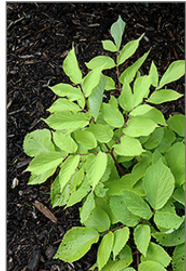
Sun King Japanese Spikenard foliage

This plant performs well in both full sun and full shade. It prefers to grow in average to moist conditions, and shouldn't be allowed to dry out. It is not particular as to soil type or pH. It is highly tolerant of urban pollution and will even thrive in inner city environments. This is a selected variety of a species not originally from North America.