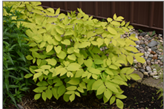
Sun King Japanese Spikenard

This plant will require occasional maintenance and upkeep, and is best cut back to the ground in late winter before active growth resumes. It is a good choice for attracting birds and bees to your yard. Gardeners should be aware of the following characteristic(s) that may warrant special consideration;