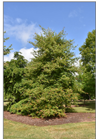
Wildfire Black Gum