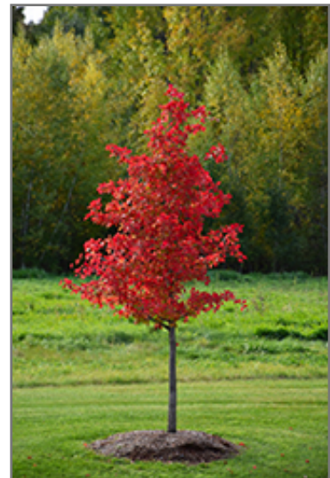
Wildfire Black Gum in fall

Wildfire Black Gum is recommended for the following landscape applications;