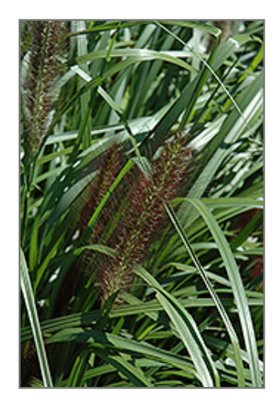
Red Head Fountain Grass foliage