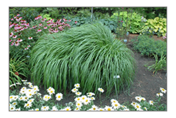
Red Head Fountain Grass