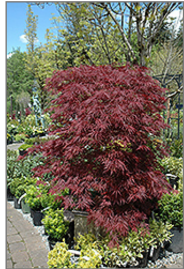
Red Dragon Japanese Maple

Red Dragon Japanese Maple is a fine choice for the yard, but it is also a good selection for planting in outdoor pots and containers. Because of its height, it is often used as a 'thriller' in the 'spiller-thriller-filler' container combination; plant it near the center of the pot, surrounded by smaller plants and those that spill over the edges. It is even sizeable enough that it can be grown alone in a suitable container. Note that when grown in a container, it may not perform exactly as indicated on the tag - this is to be expected. Also note that when growing plants in outdoor containers and baskets, they may require more frequent waterings than they would in the yard or garden.