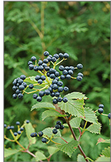
Blue Muffin Viburnum fruit

Blue Muffin Viburnum is recommended for the following landscape applications;