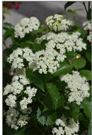
Blue Muffin Viburnum flowers