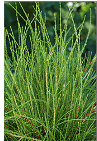
Franky Boy Arborvitae foliage